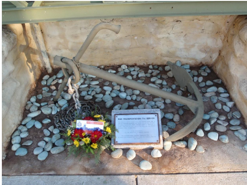
The RAE Tn anchor at the RAE Memorial, Karrakatta.